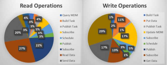
Figure 2: Read/Write Operations Decomposition

The following figure shows the read and write datatask operation decomposition expressed as time percentage and divided by each TABIOS component. All results are the average time of 10K datatasks. As expected the most time is spent on the workers performing the disk operations.